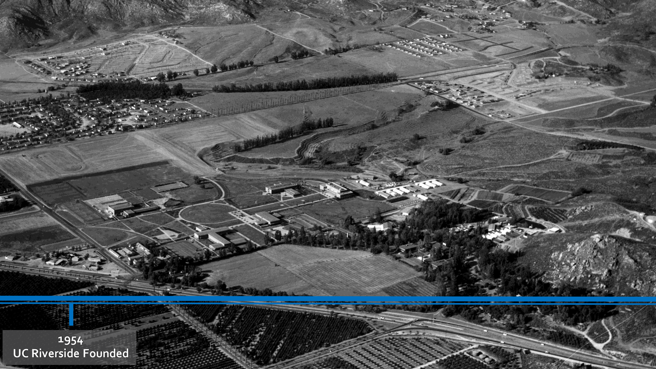
1954 UC Riverside Founded